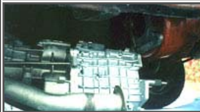
Bellhousing & Spacer Installed