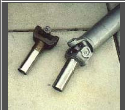
Note the larger Yoke for the TKO